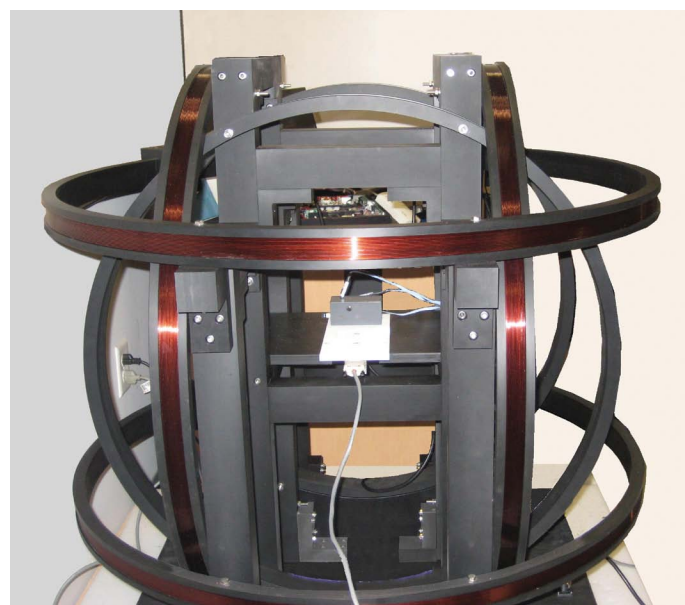
Figure 3. True Helmholtz Coils required for precision field creation.

The properties of the Mag-03MS250 sensor make it a suitable choice for such a system.